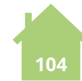
Affordable Housing Completions*

(as at end of Q1 2020) These are across 103 sites and 4 dwellings were completed in Q1 2020 alone