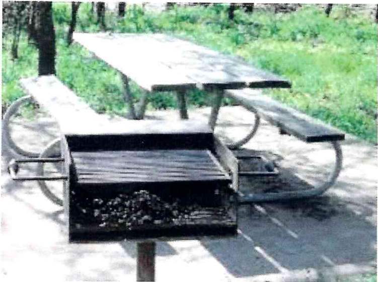
Photograph 6 Picnic table and grill