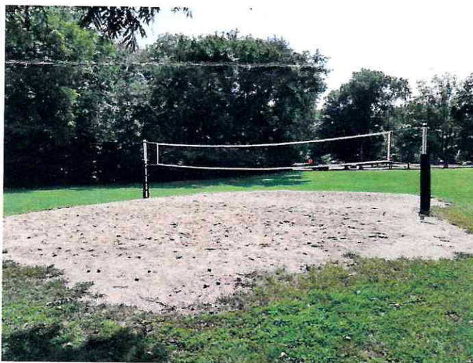
A simple volleyball court