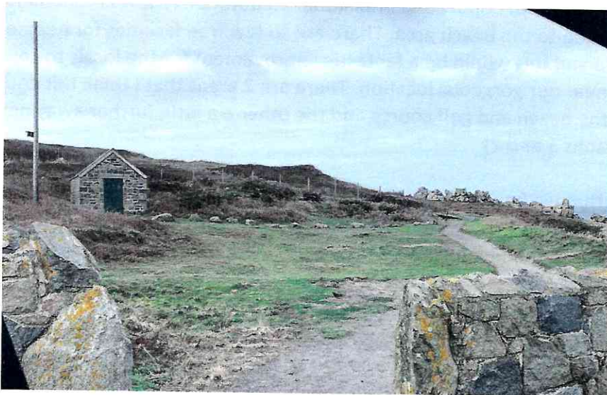
Photograph 2 A bit further out at La Jaonneuse– a lovely location for something? Maybe the volley ball court, BBQ and picnic area could be located here instead