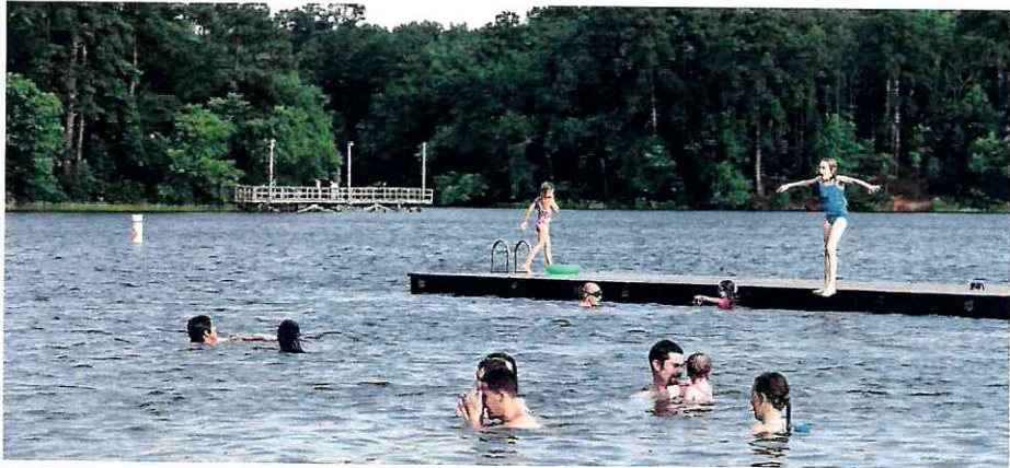
A more exotic swimming/diving platform